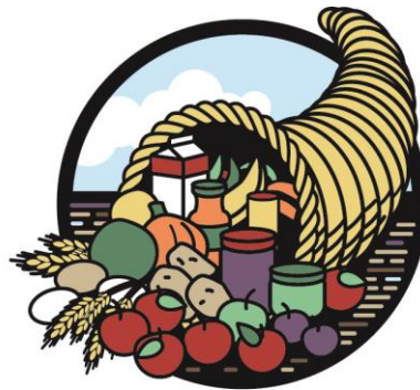
Food Bank of the Hudson Valley