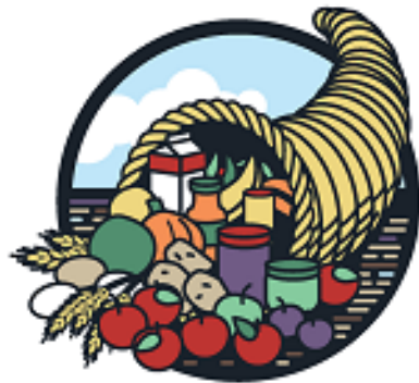
Regional Food Bank OF NORTHEASTERN NEW YORK